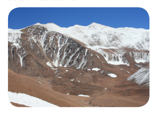
Rock Glacier in the Argentine Cordillera

egal challenges are currently proceeding in Chile and Argentina in which mining firms are accused of violating glacier laws and guidelines under their current environmental permits. The outcome of these trials are highly anticipated as those decisions may be precedent-setting and thus have profound implications in terms of future mining developments in the high-elevation permafrost areas of these countries.