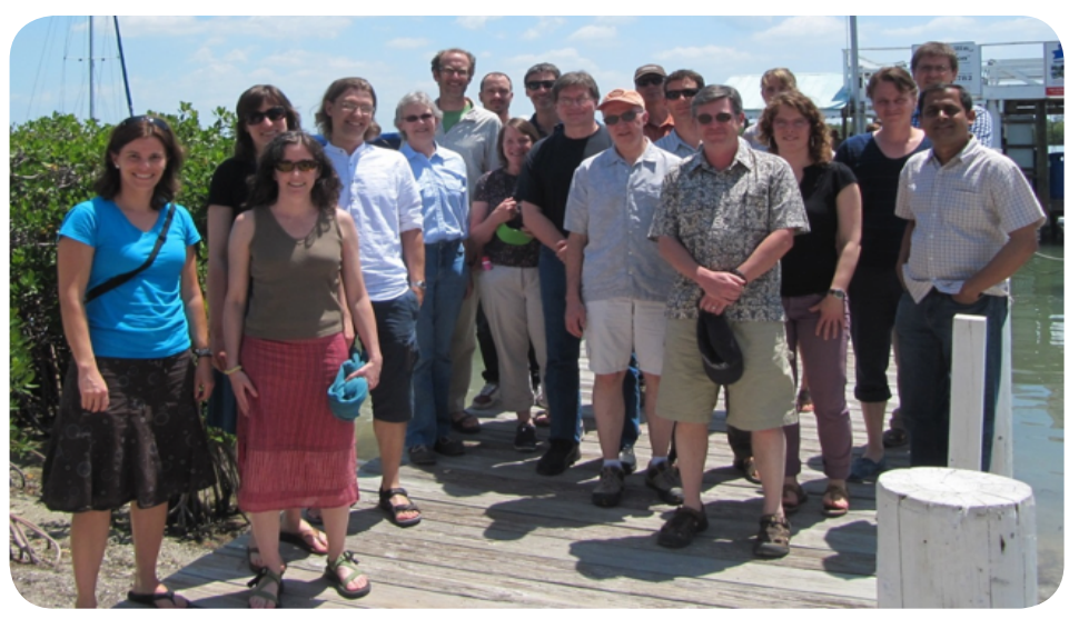
Group photo at the fifth network workshop on Captiva Island, Florida (May 2013)

N etwork related activities have produced some high visibility products that were